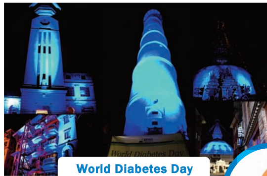
World Diabetes Day