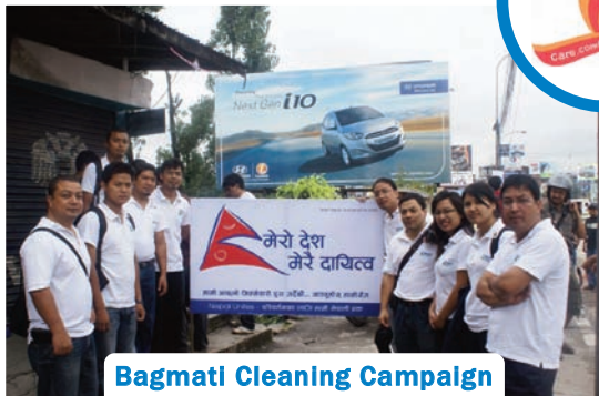
Bagmati Cleaning Campaign