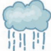
वर्षाको पानी संचितिकरण