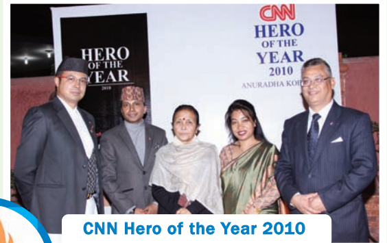
CNN Hero of the Year 2010