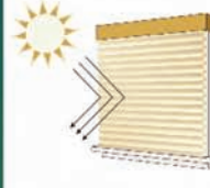
UV-Ray रोक्ने शिसा