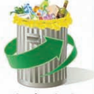
फोहरमैलाको उचित व्यवस्थापन